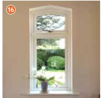
10. Hampshire, high performance sliding sash windows in refurbishment of old hospital building as luxury apartments. 11. Elegant fine lamb's tongue glazing bar detail. 12 & 15. Warwickshire, double glazed, timber window replacements for 17th Century farmhouse. 14. Millfields School, Hackney, spiral balance and dual swing sash windows