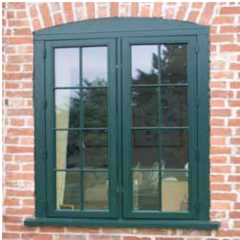
Traditional flush fitting casement

Windows are available factory-finished, in most RAL colours, fully glazed and fitted with ironmongery and high security locks.