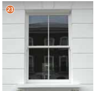
17. Cadogan Gardens, London, fixed, double glazed, timber casements. 18. Chiswick, London, special-shape, double glazed timber casements. 19. Double glazed tilt and slide sash window. 21. Premium quality hardware. 22. Blackheath, Dulwich, double glazed timber casements and entrance door. 23. Georgian terrace, London, Georgian-style double glazed timber sliding sash windows and French doorsets