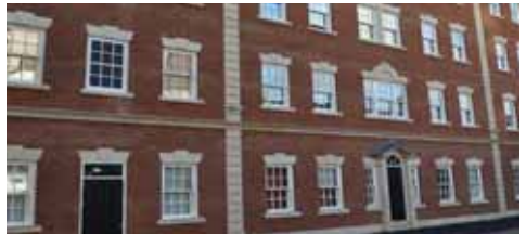
Which windows are double glazed?* The answer is on the back cover