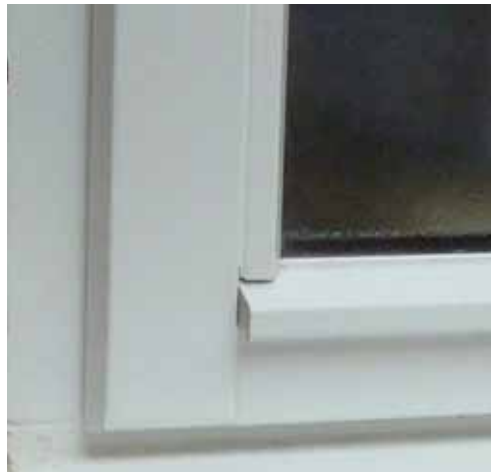
Modern storm-proof casement detail with incorrect rebated openers lipping over the face of the frame

Wood Window Alliance Window Estimated Service Life - ISO 15686-8:2008, Life Cycle Assessment research, Dr R Murphy, Imperial College London