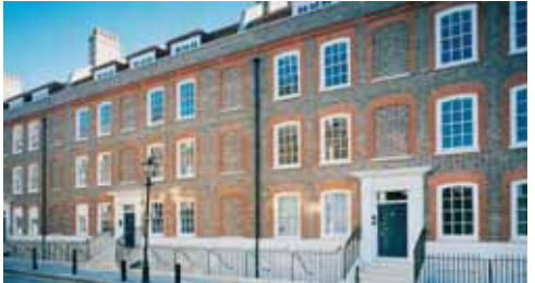
Bespoke single glazed timber windows designed and supplied by a Wood Window Alliance manufacturer have been used in these sensitive restorations